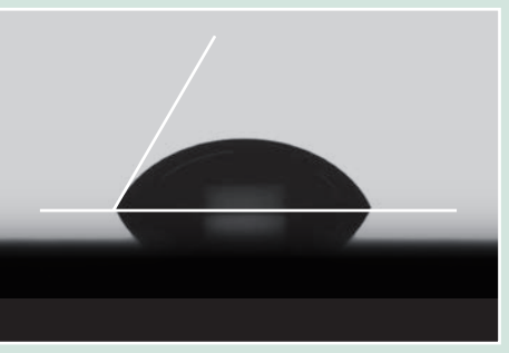
Contact angle of Oranwash L (hydrocompatible)

Oranwash L and Oranwash VL were seen to have one of the best contact angles , when compared with some of the market's best-known condensation silicones.*